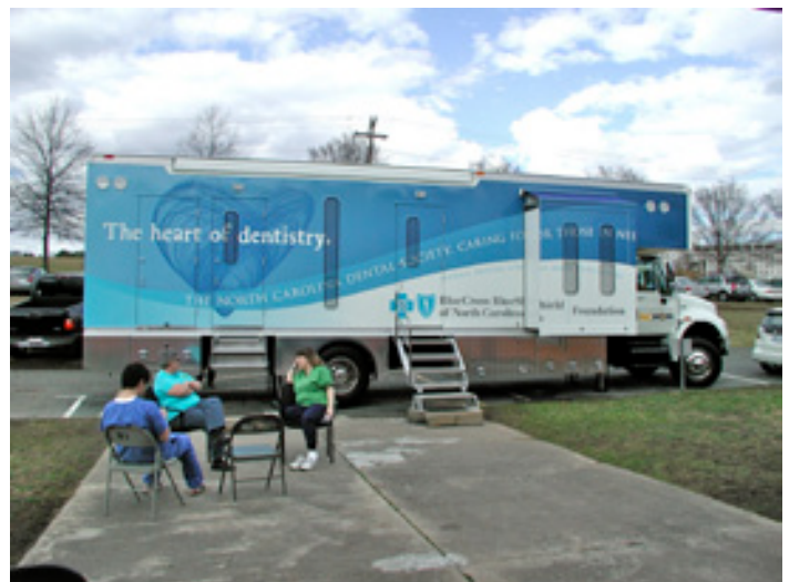
Photos from Durham March 12–13 click here to see all photos